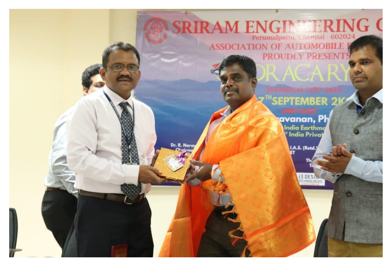
Principal honoring Chief Guest