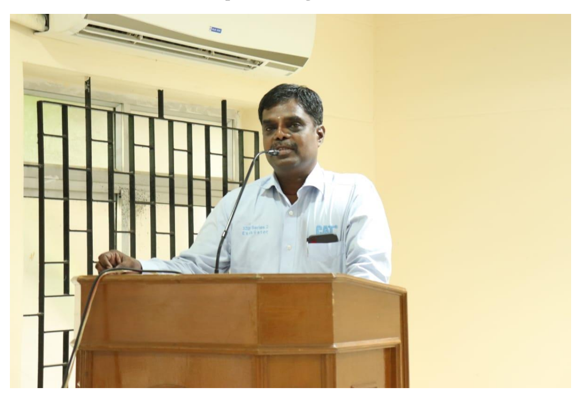
Address by Chief Guest at DRACARYS 2K19 Symposium