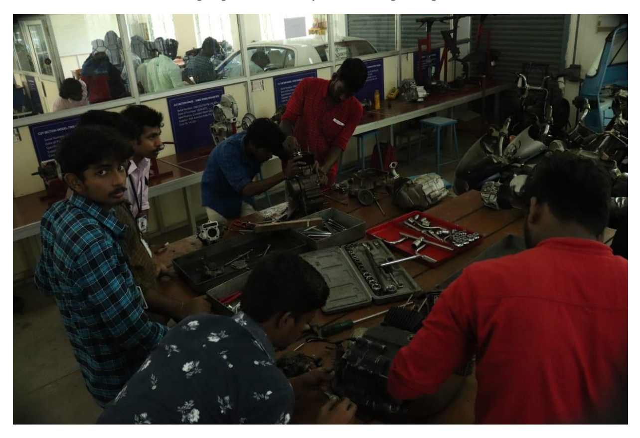
Students at the Engine assembling and dismantling event